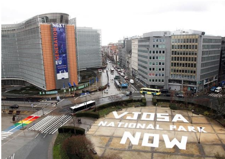
EU-Kommission in Brüssel/Belgien