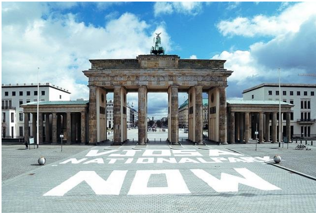
Brandenburger Tor in Berlin/Germany