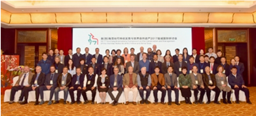
Yangcheng Workshop in December of 2017, where important decisions have been made.

In just a few years, China has moved from being one of the largest habitat destroyers of coastal wetlands in Asia to the forefront of those that protect the important coastal wetlands and footstones for many bird species on the East Asian migratory route.